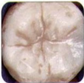
Chewing surface before sealant

All services are provided by a licensed dentist or dental hygienist employed by the Division of Public Health. Parents/guardians will receive information about their child's dental visit and a follow-up call if additional dental care is need. Medicaid and CHIP will be billed for services provided. Services not covered by insurance will be provided at no cost.